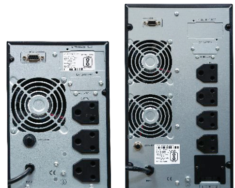
► REAR PANEL